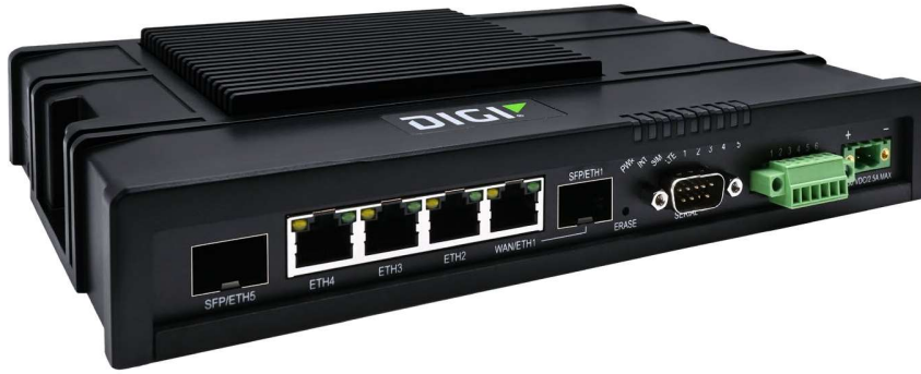
DIGI IX40 — FRONT